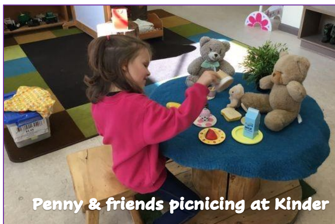
Penny & friends picnicing at Kinder

LEARNING AREAS: Imaginative Play. Sharing Play